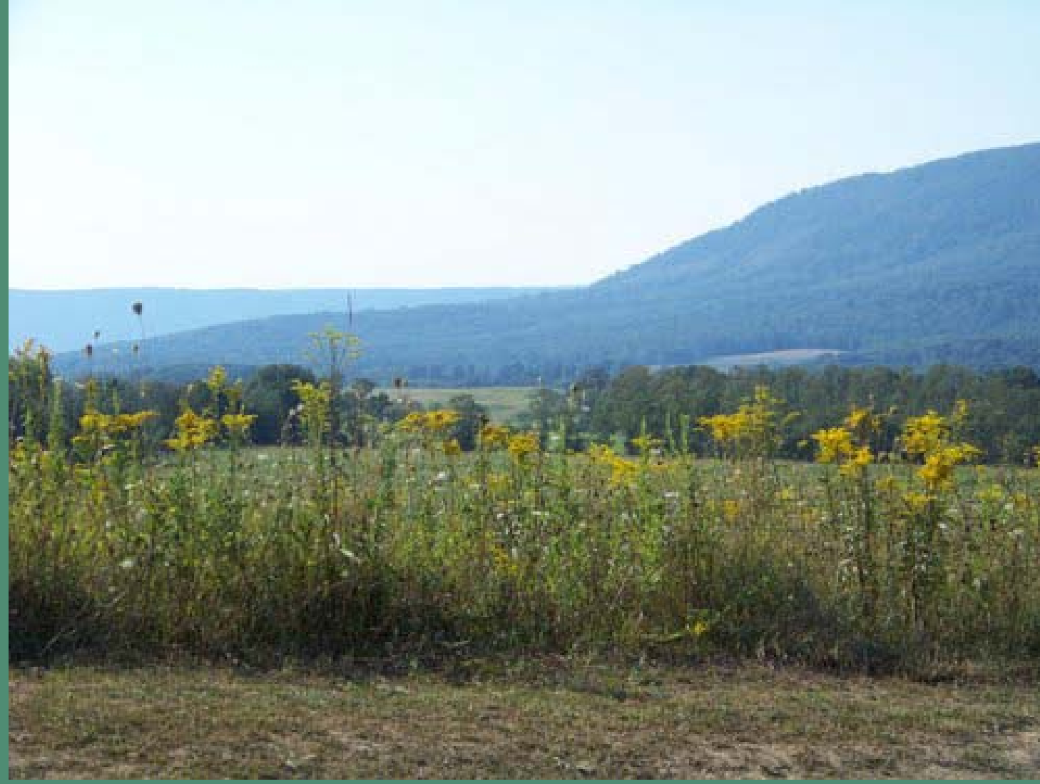
NATURAL RESOURCE PROTECTION