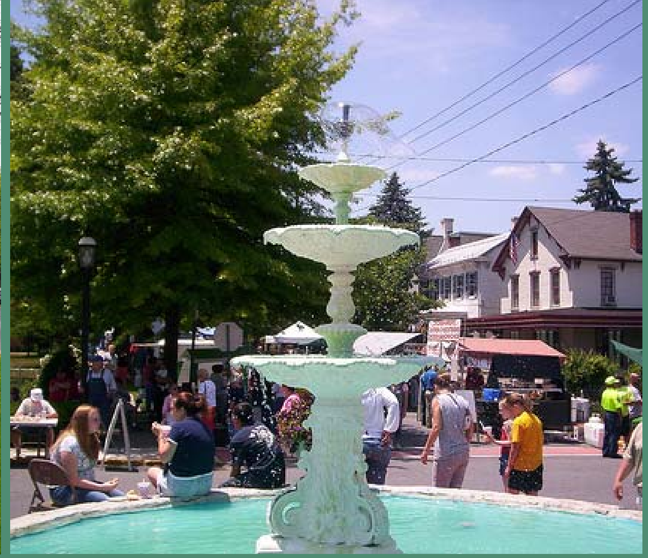
CREATION OF LIVABLE COMMUNITIES